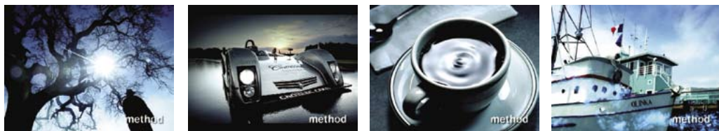
Four images using a variety of Tinder sparks.

Tools These 18 Tools aren't the most glamorous but they'll help you get the job done. Erode your mattes with sub-pixel precision using Dilate . This superior plug-in also includes some sophisticated compositing tools and spill suppression.