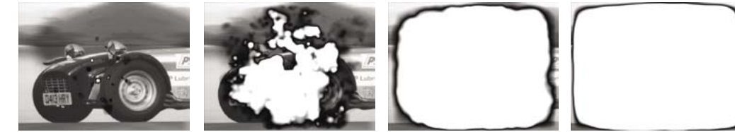
Animated burn through using Tinder's OldFilm

Generators Choose from 18 clip generators. View the reflected light patterns seen at the bottom of swimming pools with Caustic or use it to breakup mattes; simulate fire, smoke, fog, snow and water with our Elements particle effect; choose from a dozen