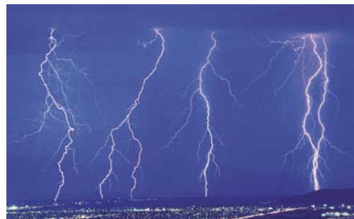
One or more of these lightning bolts are computer generated with Tinder's Lightning!