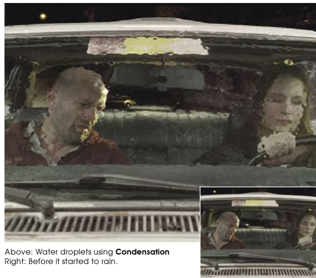
Above: Water droplets using Condensation Right: Before it started to rain.