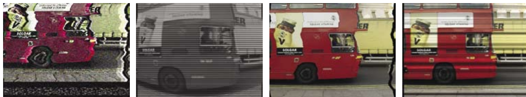
BadTV BadTV Security Camera BadTV Edge Distortion BadTV Interference

Tinder - a vast collection of plug-ins that extend the creative possibilities of flame, flint, Inferno, fire or smoke. Most effects come with scores of parameters that can be keyframed to give a very individual look or you can choose from a number of popular saved presets. The plug-ins take advantage of additional processors and have been designed to work at video or film resolutions and multiple colour depths. The Foundry products are used extensively in film post production helping digital artists on Lord of the Rings, Tomb Raider and Armageddon.