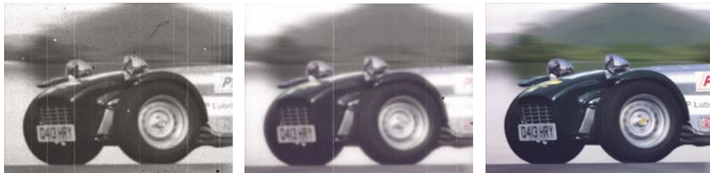
OldFilm B&W OldFilm Forties OldFilm Modern