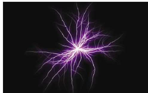
Plasma using Tinder's Lightning