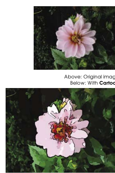
Above: Original image Below: With Cartoon

Effects Choose from almost 40 effects to enhance any project. Add scratches, dust, flicker and more with OldFilm ; simulate poor television reception with BadTV ; drip water on glass with Condensation ; add an interesting grade with DiffusionFilter ; view images through Glass ; add a