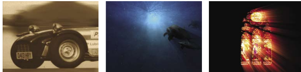
OldFilm Sepia Dolphins and stained glass window enhanced with Shaft